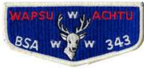
343A Wapsu Achtu YS2