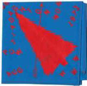
384A Tiadaghton eN1973-2 1973 | OA BBV6: EN1973-2