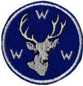
343A Wapsu Achtu R1