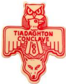
384A Tiadaghton eSLIDE1960 1960 | OA BBV6:

1960 Tiadaghton Lodge Conclave (Lodge Social) White Slide Red Printing With Totem Pole Containing Owl, Thunderbird And Wolf. Made by Artcraft Manufacturing Company, Grand Rapids Michigan.