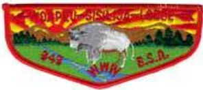
343B Woapeu Sisilija S3d | OA BBV6: