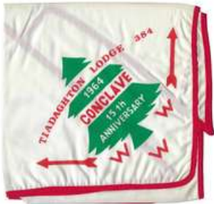
384A Tiadaghton eN1964-2 1964 | OA BBV6:

SSC; 1964 "15th ANN" Conclave. Event STAFF issue.