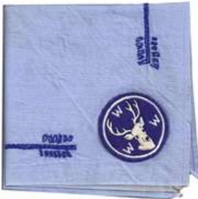
343A Wapsu Achtu YN1