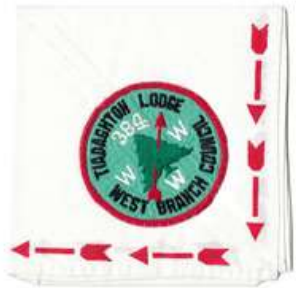
384A Tiadaghton N1 | OA BBV6:

CEREMONIAL TEAM NECKERCHIEF R1 ON WHITE NECKERCHIEF WITH RED SILK SCREENED ARROWS AS BORDER