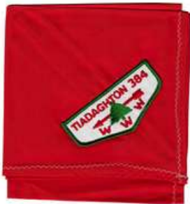
384A Tiadaghton eN1963 1963 | OA BBV6:

1963 Conclave. F2a ON RED SATEEN NECKERCHIEF