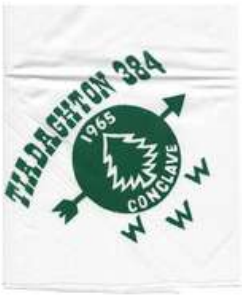
384A Tiadaghton YN1 1965 | OA BBV6:

SSC; 1965 Conclave. UNKNOWN USAGE. Possible test silk screen. Un-hemmed neckerchief. Design and text silk screened in all dark green ink (regular issue has center design element screened in red).