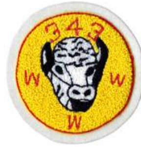
343B Woapeu Sisilija ZC1