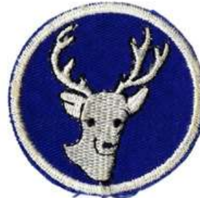
343A Wapsu Achtu YR4