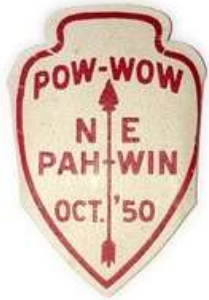
161A Ne-Pah-Win L1