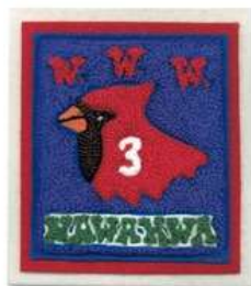
3B Nawakwa YC1