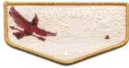
3B Nawakwa S162