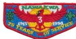
3B Nawakwa ZS3