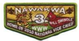
3B Nawakwa QS1