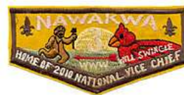
3B Nawakwa ZS7