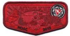
3B Nawakwa S142