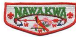
3B Nawakwa S16a