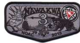
3B Nawakwa S143