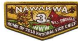
3B Nawakwa S115