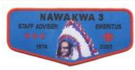
3B Nawakwa W1