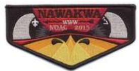
3B Nawakwa S150