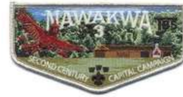
3B Nawakwa S163