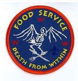
3B Nawakwa QR2