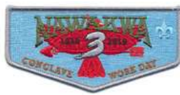
3B Nawakwa S184