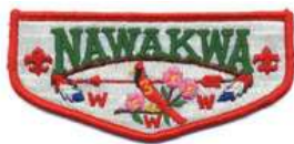
3B Nawakwa S16b