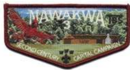
3B Nawakwa S166