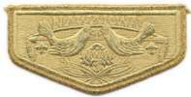
3B Nawakwa S58b