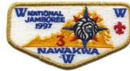
3B Nawakwa S66a